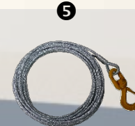
Complete wire rope kit with thimble loop and hook