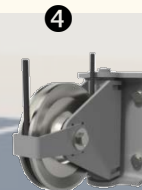
Articulated diverting pulley (ref. PA)