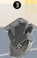
Fixed diverting pulley (ref. PF)