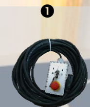
3 push buttons pendant control