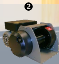
AGON 300 kg electric winch